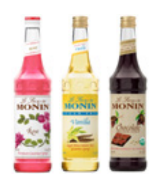
CLASSIC, SUGAR FREE & ORGANIC SYRUPS