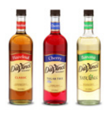
CLASSIC, SUGAR FREE, & NATURAL SYRUPS

DaVinci Gourmet® offers a variety of high quality products, including coffee mixes, smoothie mixes, and delicious syrups.