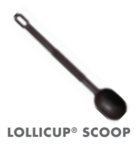
Item No U1015