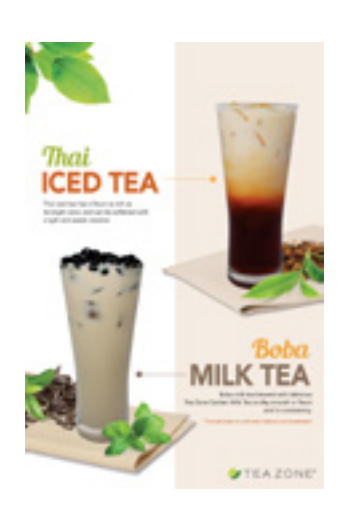
BOBA MILK TEA & THAI TEA