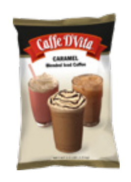
BLENDED ICE COFFEES