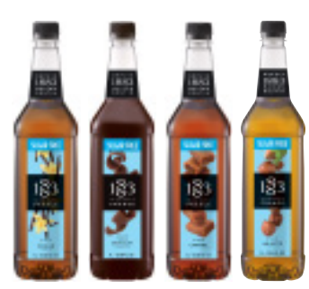
SUGAR FREE SYRUPS