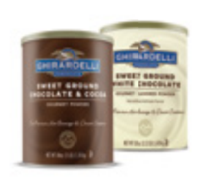
SWEET GROUND CHOCOLATE

Established in 1852, Ghirardelli® is America's oldest continuously operating chocolate maker. The company is over 160 years old! Ghirardelli is one of the few American companies that produces chocolate starting from the selection of the cocoa bean and ending with finished products.