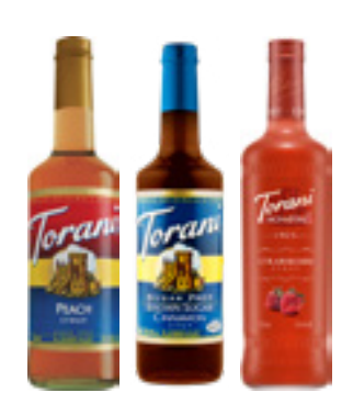
CLASSIC, SUGAR FREE & SIGNATURE SYRUPS

Torani® has been family owned for three generations and has decades of café and restaurant drink innovation. Torani products are crafted to balance in the finished drink, guaranteeing a delicious taste experience.