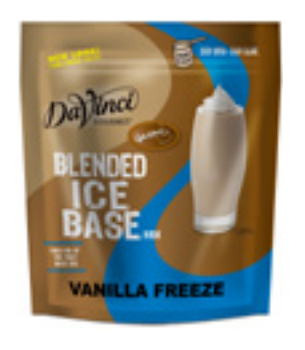
BLENDED ICE BASES