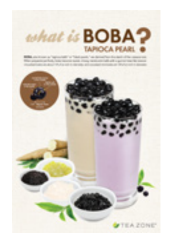
WHAT IS BOBA

Whether it's a simple recipe card, a table-top advertisement, or a poster to grab the attention of those passing by, we have the ideal marketing and point of sale (POS) materials to help promote your products and draw in customers. Find informative and eyecatching posters, postcards, and more (subject to availability).