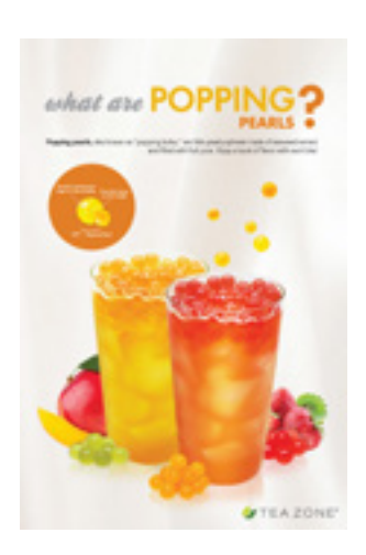
WHAT ARE POPPING PEARLS